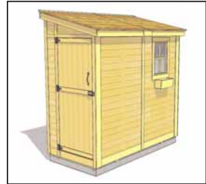
Door can also be configured on side.